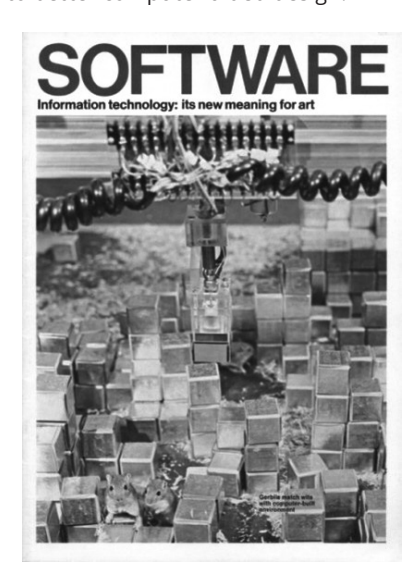
[Figure 4] Software: cover of the exhibition catalogue, 1970.

While beginning with humans, Negroponte and his Architecture Machine Group quickly turned away from conversations, interviews, and Turing tests to move towards immersive environments and a new frontier: art. They designed a micro-world called SEEK (fig. 4) for the famous Software exhibition held at New York's Jewish Museum in 1970. The installation consisted of a small group of Mongolian desert gerbils (chosen according to Negroponte for their curiosity and inquisitive nature), which were then placed in an environment of clear plastic blocks that was constantly rearranged by a robotic arm. The basic concept was that the mechanism would observe the interaction of the gerbils with their habitat (the blocks), and would gradually "learn" their living preferences by observing their behavior. This "cybernetic machine" understood the world as an experiment, but also meant the introduction of cognitive and neuro-scientific models of intelligence into the environment. Apparently, traumatizing gerbils was a route to better computer-aided design.