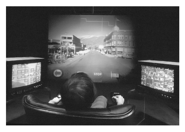
[Figure 2] The Aspen Movie Map, Architecture Machine Group at MIT, 1978–1979, https://www.youtube.com/watch?v=Hf6LkqgXPMU.

Arguably one of the most important models for the contemporary responsive environments and virtual reality therapies, like the one in Farocki's Serious Games , is historically the Aspen Movie Map (fig. 2). Built through the careful survey of gyro-stabilized cameras that took an image every foot traversed down the streets of the city of Aspen in Colorado, the Aspen Movie Map was a system working through laser discs, a computer screen and a joystick that allowed a user to traverse the space of the city at their leisure and speed.