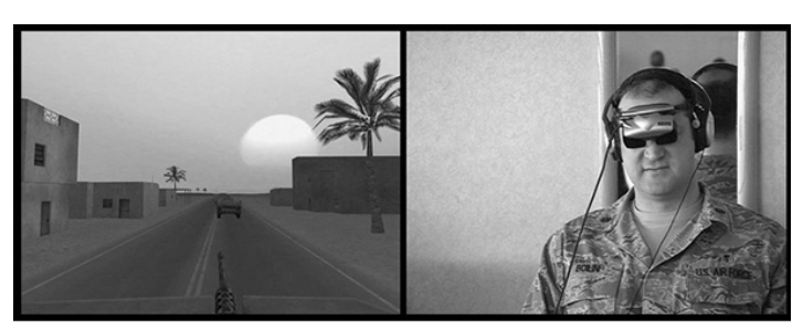
[Figure 1] Harun Farocki, Serious Games I-IV, 2001.

In its multi-screen architecture, the installation most strenuously insists on a disjuncture between the camera apparatus and the human eye. Vision, for Farocki, is an activity beyond and outside of the human subject. It is a product emerging from the realm of machines and apparatuses of capture, one that retroactively conditions and manufactures "human" vision. At the limits of his analysis is the possibility that vision—at least in the human capacity to survey—is impossible, even as the ability of machines to record, store, memorialize, and reenact images has never been greater. More critically, it would appear that machinery is capable of rewiring the human brain. What Farocki addresses is that our very vision and cognition are now thoroughly mediated. Vision has become in many ways mechanized, perhaps even inhuman in being unable to recognize human subjectivity.