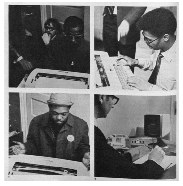
[Figure 3] Nicholas Negroponte, The Architecture Machine, 56.

Interestingly, in moving from machine to human intelligence, race was a critical conduit of passage. The first full-fledged demo of human computer aided design run by the Architecture Machine Group was a series of Turing-inspired tests (also known as the Hessdorfer Experiment) done on tenants in Boston's then under-privileged neighborhood of the South End. There, three African American men were recruited from a public housing project and asked to type on a computer keyboard what their main concerns were regarding urban planning and neighborhood improvement, and what they wished urban planners and designers would take into account (fig. 3).